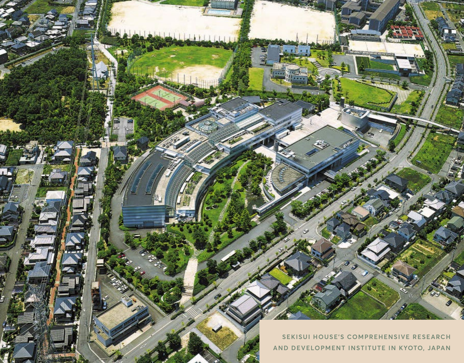
SEKISUI HOUSE'S COMPREHENSIVE RESEARCH AND DEVELOPMENT INSTITUTE IN KYOTO, JAPAN