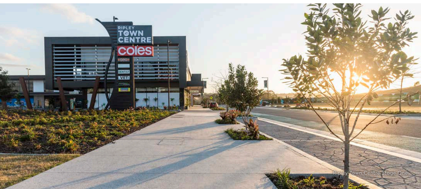
Ripley Town Centre Stage One

With the historic rising costs associated with housing, transport and living, and increasing levels of congestion in SEQ, now, more than ever, careful consideration is needed to provide for growing communities across the region.