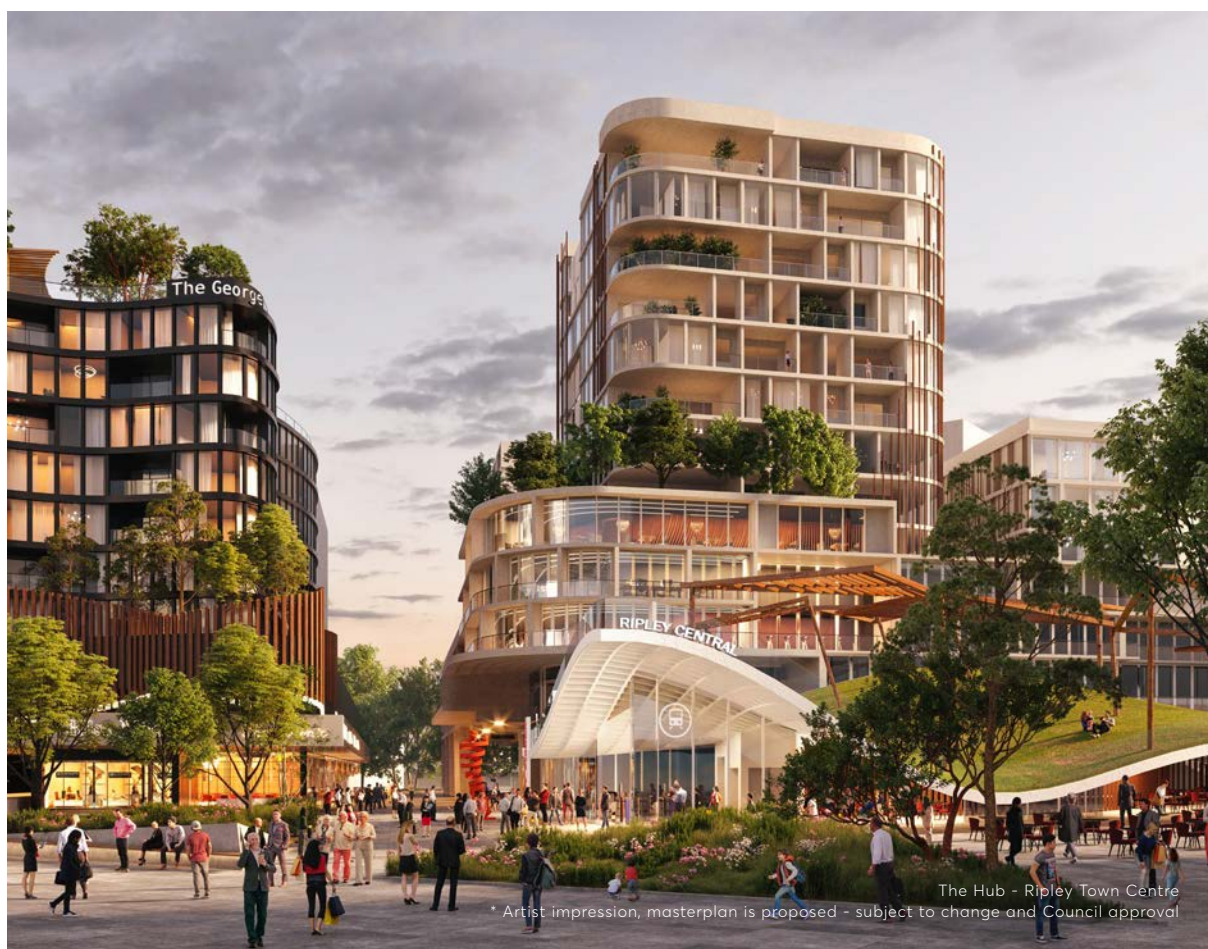
The Hub - Ripley Town Centre * Artist impression, masterplan is proposed - subject to change and Council approval

Considered design is essential to ensure the success of any masterplanned community. While there are often many perspectives and players involved in the development of a masterplan, it is critical to ensure place is a priority when creating communities that people will thrive in.