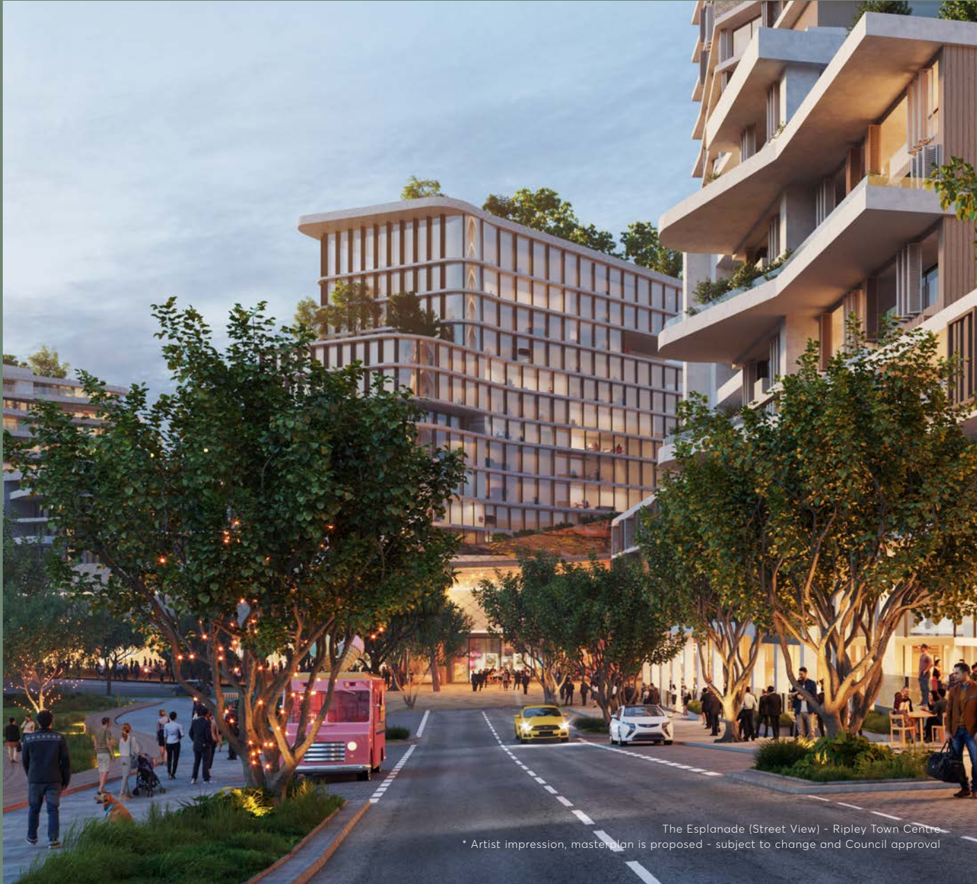
The Esplanade (Street View) - Ripley Town Centre * Artist impression, masterplan is proposed - subject to change and Council approval